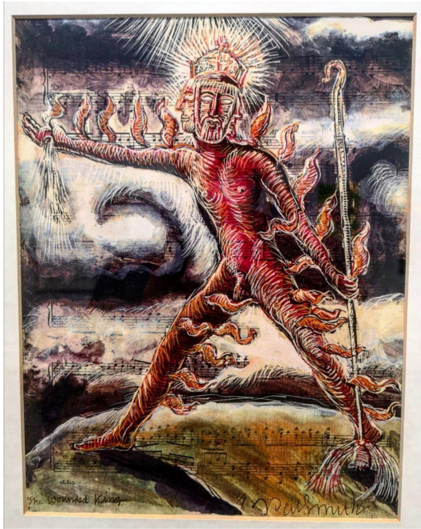
Paki Smith, Various drawing , 1990's, Mixed media on paper.